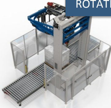
PF 80 ROTATING RING