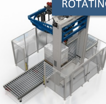
PF 120 ROTATING RING