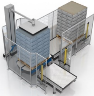
PF 30 ROTATING PLATFORM