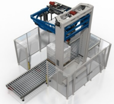
PF 60 ROTATING RING